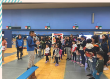
Coordinating a sports event at the Hong Kong Sports Institute (HKSI)