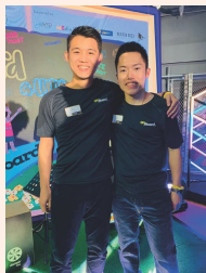
"Athletes Engagement Campaign", OnBoard For Good Limited