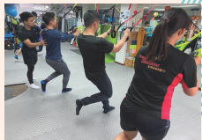
Instructing stretching technique at a stretch therapy centre

Course "PES6253 Experiential Learning in Sports Industry" offers students the opportunity to learn by doing and engaging in the real-life workplace environment in the sports industry, including non-governmental organizations (NGOs) and/or private companies etc.